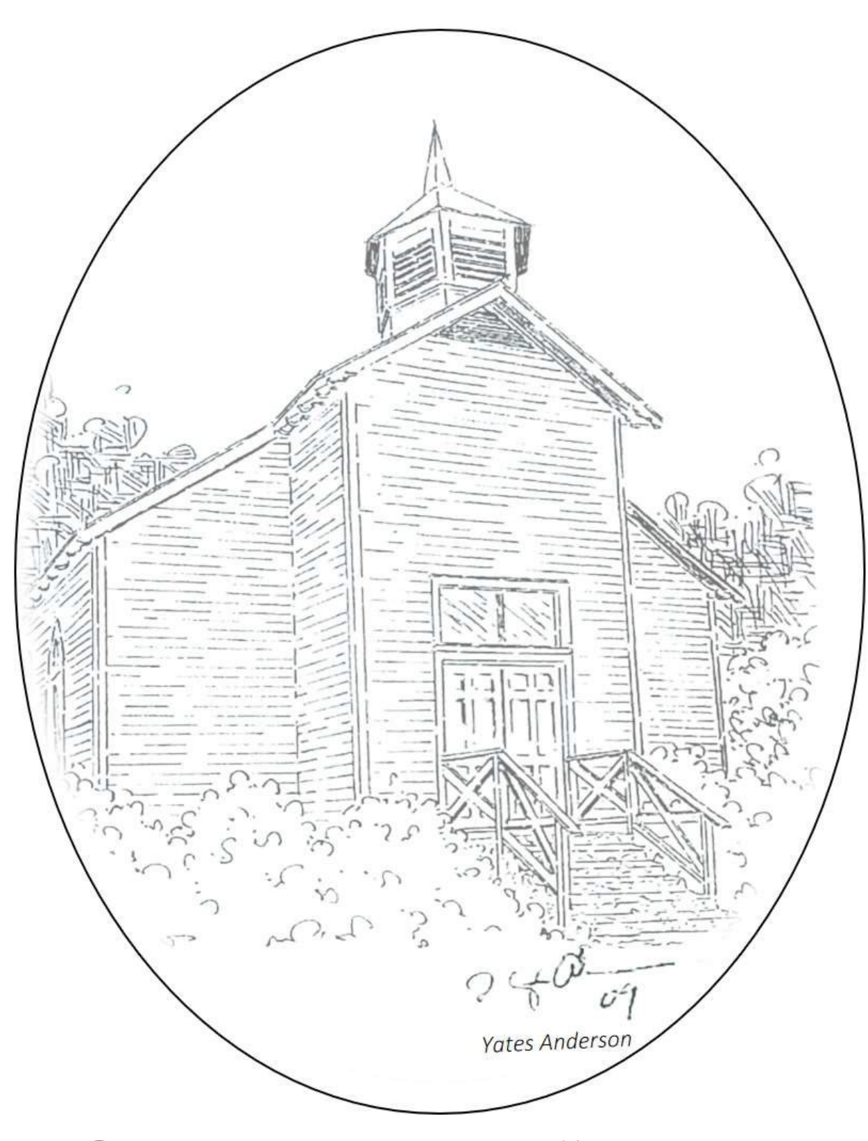
Lake Toxarvary United Methodist Church April 21st, 2024